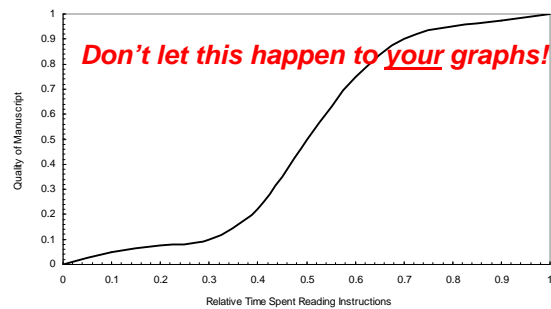
Fig. 2. Example of an improperly titled figure. The numerics and the labels on the axes are illegible. This will cause a submission to be rejected. Don't let this happen to you!

Here is a common example of what can go wrong with the numbering and sizing of axis titles on a graph. In this case, the graph was initially pasted at a much larger size than the column width, and then reduced to fit: